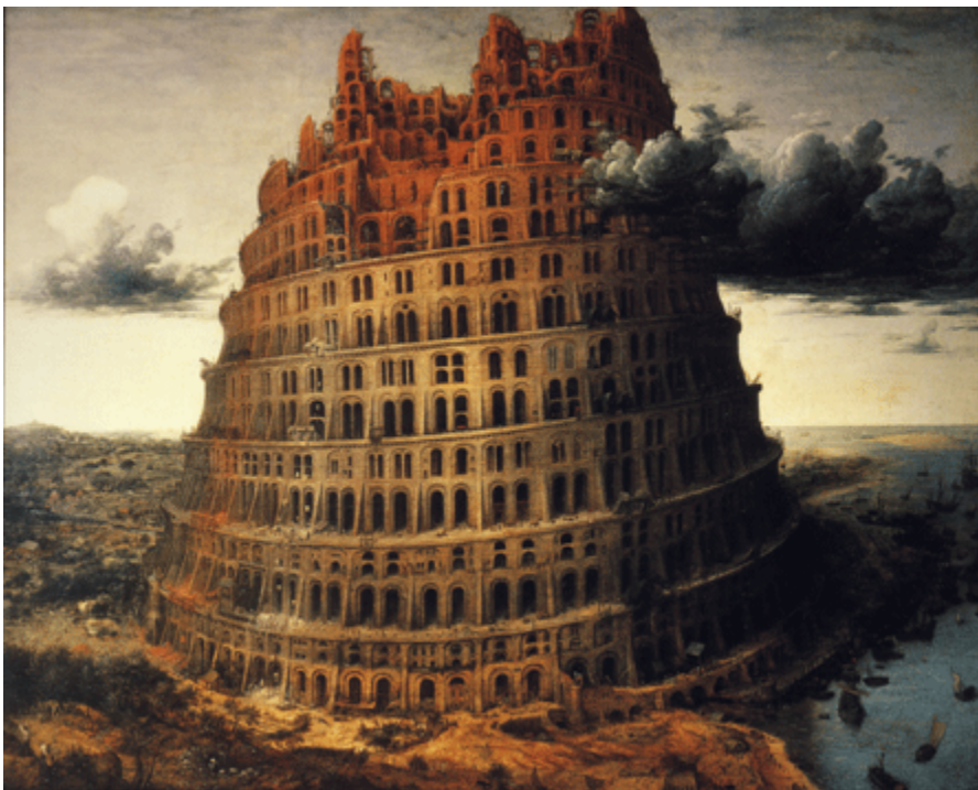
Fig. 1: The Tower of Babel by Pieter Bruegel the Elder (1563)

The story of the tower of Babel (probably derived from the ancient Sumerian myths around their great towers, or ziggurats) is well known [figure 1]. Divine intervention shattered humanities single language into a multiplicity of tongues, thus sowing confusion (balal is the Hebrew word 'to confuse'). To describe the structural and advocacy constructs in Europe and the USA as 'Towers of Babel' underestimate the scale of the problem. There is little interest in cancer research policy making circles about questions of dependence and interdependence, asymmetrical relations amongst funders and countries, centre-periphery relations or indeed in research imperialism. And yet considering the scale of cancer research activity, investment and the socio-political prominence that it enjoys such questions must be addressed. Without this understanding it is seriously questionable whether any major funder, country or representational body can honestly construct a strategy that has external validity.